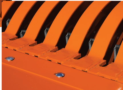
Extra fine grate

Une extension conique est disponible en option afin d'éviter le débordement de la cuve lors du remplissage avec de longues balles rectangulaires.