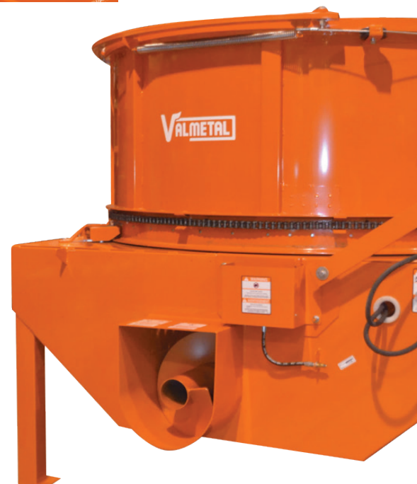
Outlet shown with guard removed for illustration only.